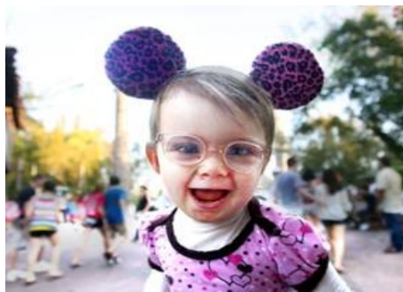
I've got ears!